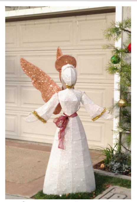
Our own guardian angel!