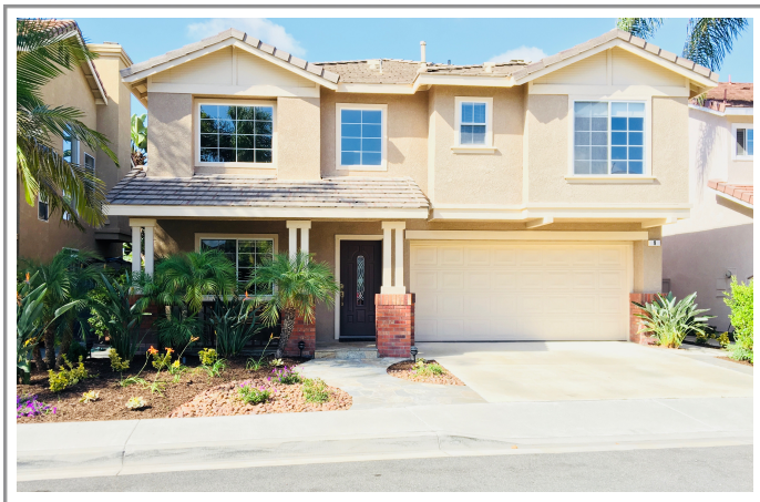
9 Sherwood Drive is a perfect example of a beautiful California Summit home.

This newly updated yard may be simple in its design, but it exudes an elegance in its appearance.